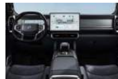
BLACK & RED